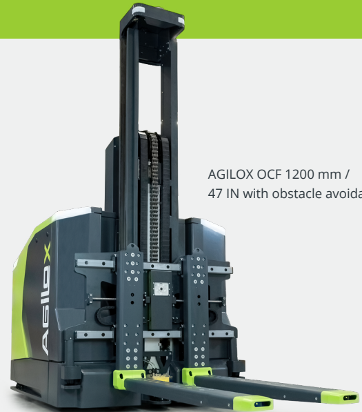
AGILOX OCF 1200 mm / 47 IN with obstacle avoidance

1,600 MM 1,500 KG 1.4 M/S 63 IN 3306 LBS max. speed max. lifting height max. lifting weight